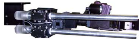
Disruptor Mounts Single or Dual versions with Standard 1.5 inch hole. Comes with camera and lasers.