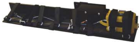
Sensor Mount L-Shaped platform with straps for mounting various accessories.