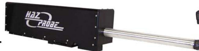
Shotgun Mount With camera and optional lazer. Shotgun not included. Winchesters preferred.