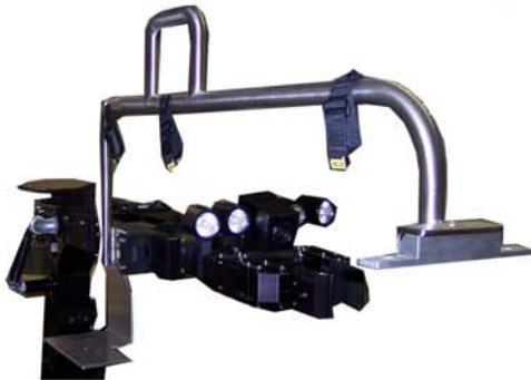
Xray Mount For filmless or film Xray units. Gripper can be rotated up or down to be out of the way.