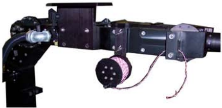
Drop Charge Reel Slip ring rotary coupling pays out wire without twisting.